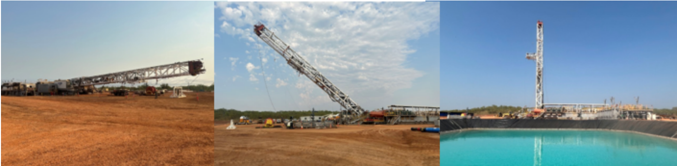
Ensign Rig Being Mobilised at C-5H