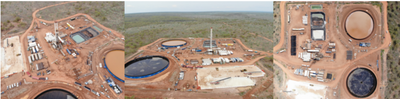
Drone photos of C-5H