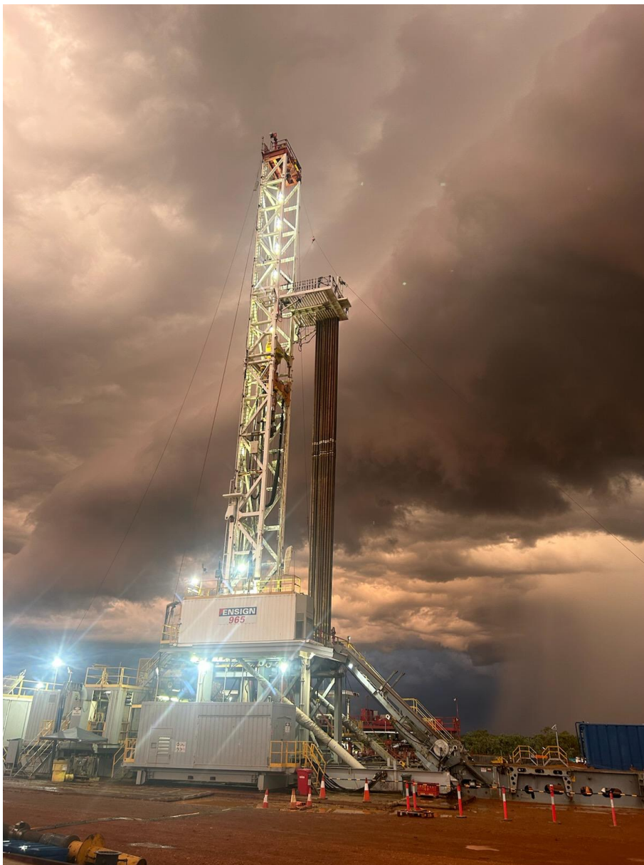
Carpentaria C-5H Ensign drill rig on location in EP187