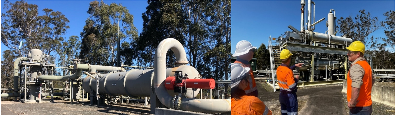
Carpentaria Gas Plant in operation immediately prior to acquisition