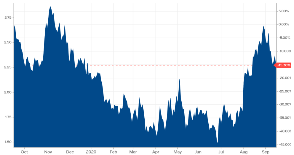
Exhibit 2: Henry Hub gas 12-month historical price series (USD/MMBtu)