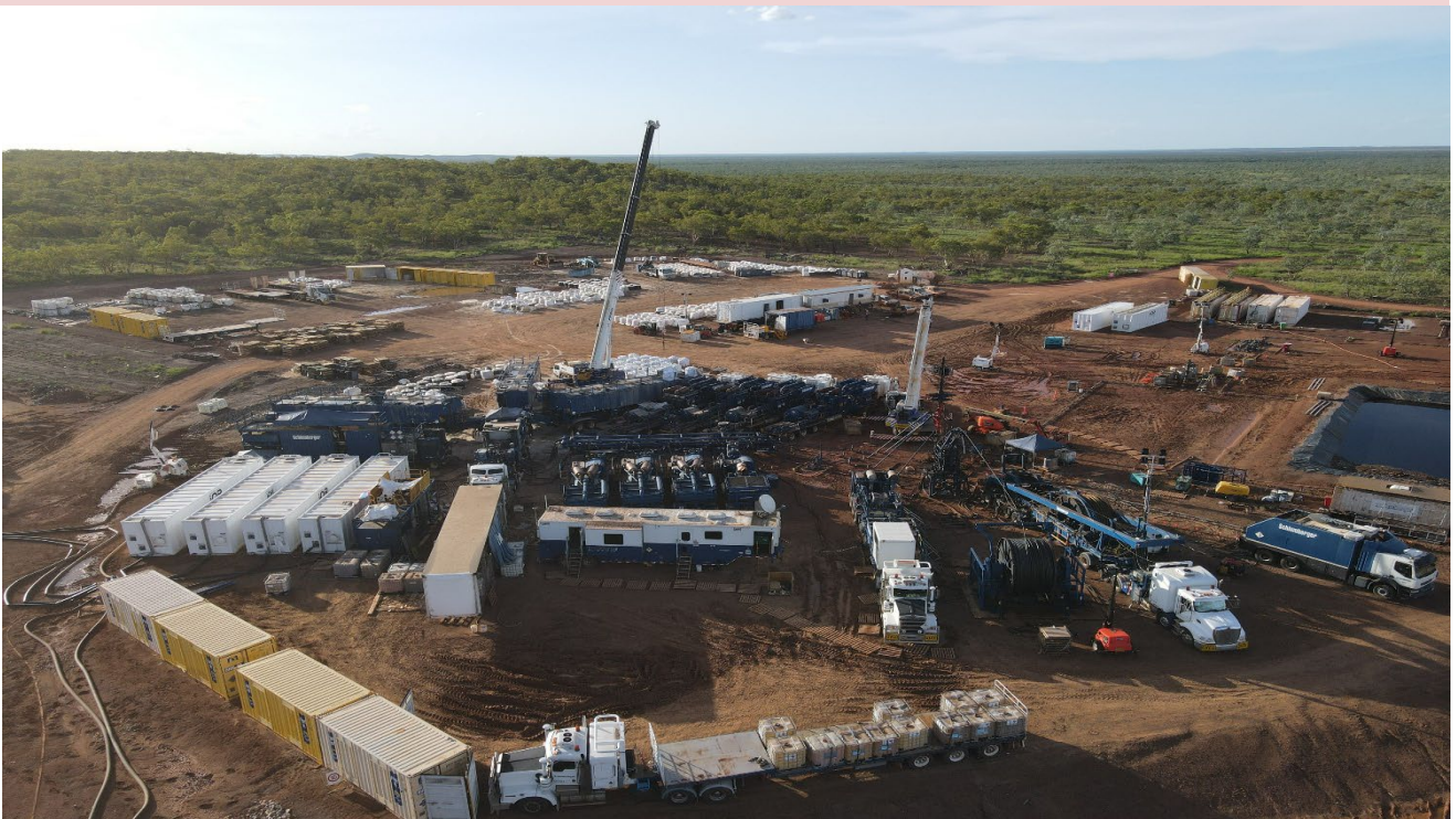
Schlumberger hydraulic stimulation operations on C-3H well

The strong cost performance of this program leaves Empire well-funded for the critical upcoming work required to make a Final Investment Decision.”